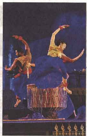
ENERGISING THE SOUL: Moving people from religion to responsibility and turning their 'gaze inwards' is the only way to save the world from an ecological disaster, Sadhguru Jaggi Vasudev said as he ushered in Mahashivaratri at the Isha Yoga Centre at Velliangiri near the city on Monday. A nightlong cultural extravaganza followed