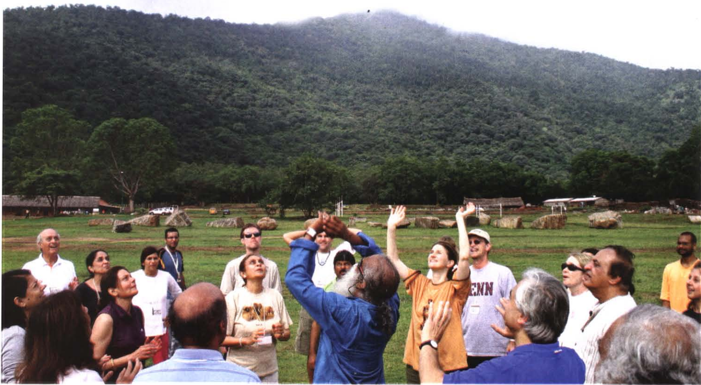
Sadhguru Jaggi Vasudev is an international spiritual master, author and authority on yoga, with profound spiritual and cultural insights on health and human values.

True understanding of the inner mechanism of what we call as human and true understanding of the cosmic splendence has essentially come from the spine of knowledge which was poured out of Shiva's knowing. The influence of this one being on the world is very meagrely acknowledged; much of it has never been acknowledged. Who He has been, what He has contributed to the human race, definitely has not found enough acknowledgement. In many ways, He has been the fundamental nourishment for every spiritual movement on this planet. It is my dream that some day, He will be acknowledged fully. It has been the want of those who have known Him from within. In many stealthy ways, I have managed to take Shiva into places where doors were never open for Him; to many places where otherwise just an utterance like that definitely would have meant you were shown the door. There is a story on how the Velliangiri Mountains became known as the 'Kailash of the South.' Kanyakumari, a maiden from the southernmost tip of India aspired for Shiva and decided that she will not wed anyone else but Him. People said, "This is foolish. He is somewhere in the Himalayas; He doesn't belong to this world and how are you going to marry Him?" But she would not give up. Her unrelenting devotion